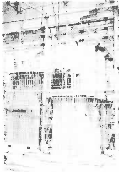
This 1937 photo of the E Street Substation shows the old "Chalk Rock" building which housed the original steam generators. The structure can still be seen on North E St. between Chestnut and Laurel Ave.