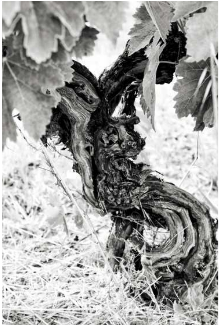
^ 100 year old gnarled Mission grape vine

While clearing a hillside they discovered three acres of hidden vines in the brush. They were originally thought to be Zinfandel grapes as such; later DNA testing revealed that they were Mission Grapes, not the most desirable for making wine in Pinot Noir country. Nobody wanted to purchase them.