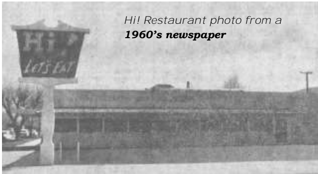
Hi! Restaurant photo from a 1960's newspaper